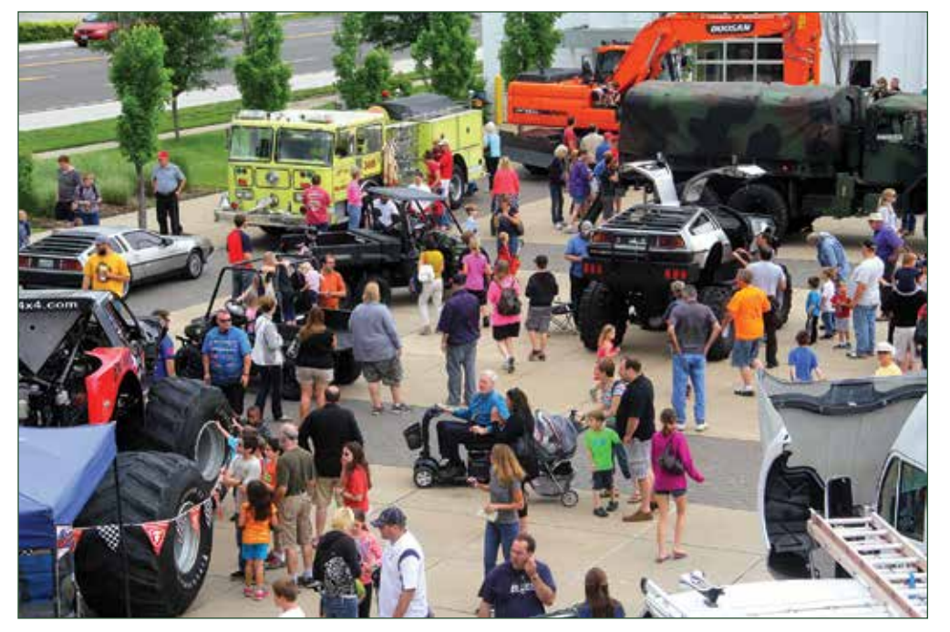
Big Truck Day at the Kemp Auto Museum in Chesterfield Valley is an annual favorite of kids and adults. The free event provides an opportunity to see large, working vehicles up close and personal.