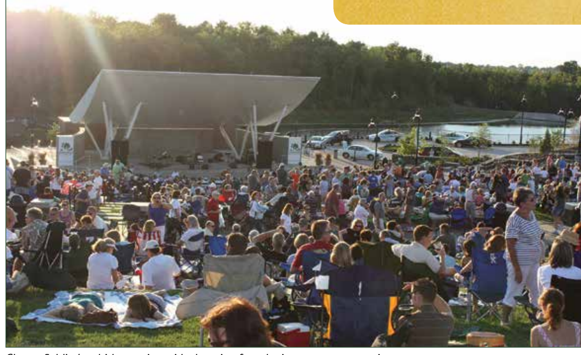
Chesterfield's Amphitheater is an ideal setting for relaxing to summer music.

"Frozen" Join in the special singa-long experience of the Disney's hit! The audience can sing along to their favorite songs with the help of a bouncing snowflake. Fearless optimist Anna sets off on