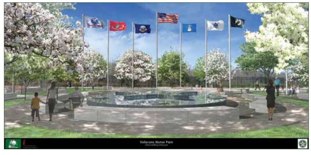
A sketch of the proposed park honoring veterans.

The free event was held April 9 at City Hall with a theme of "Relax. Refresh. Renew." Participants received sample products, information, demonstrations and health screenings tailored to the 50+ community.