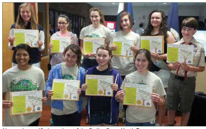
New and recertified members of the Stellar Green Youth Team.

The Youth Partners have participated in the City's annual Earth Day activities and recycle drives and continue to volunteer their time through sustainability-centered endeavors of their own creation. Many of these individuals have given their time