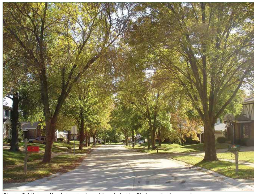
Chesterfield's tree-lined streets play a big role in the City's aesthetic appeal.

QUESTIONS ABOUT THE PROGRAM WILL BE ANSWERED BY THE PUBLIC SERVICES DEPARTMENT AT 636.537.4762.