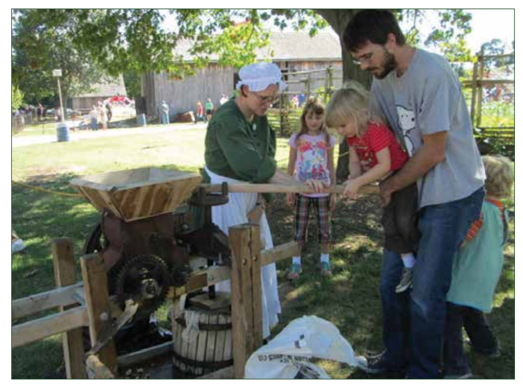
Faust Park's Olden Days is a place to have fun ... and you might just learn something.