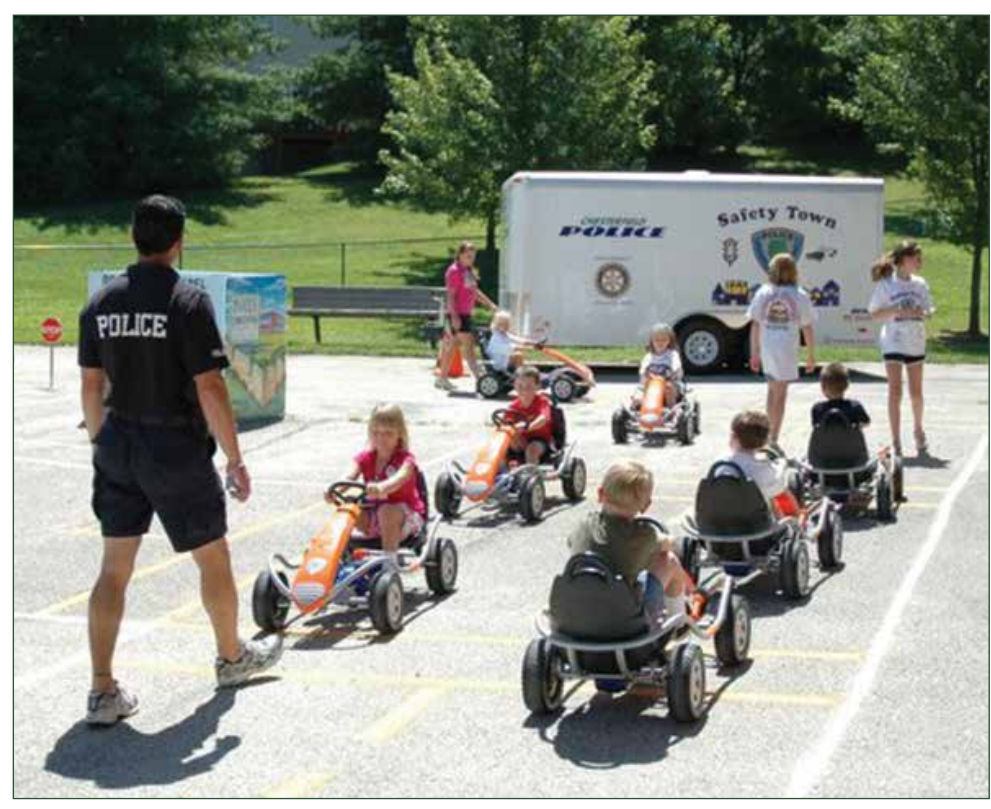
Kids learn basic traffic safety under the watchful eyes of police officers and volunteers.

Johnson remains at the helm of the department, which now includes nearly 90 commissioned officers and is celebrating its first quarter century.